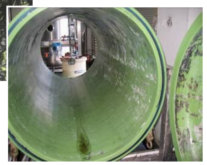
After cleaning and remove the sludge